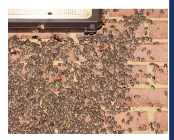
Figure 2: Brown marmorated stink bugs use our homes and other building to escape from exterior temperatures. Hundreds of them can invade a single home, a major annoyance for the humans also just trying to get through the winter months.

Using bug bombs or other insecticides in the home will not help to deal with stink bugs and will only serve to expose the people inside to residues.