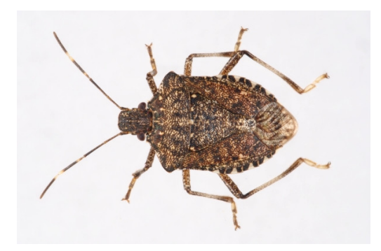
Figure 1: Brown marmorated stink bugs are speckled with brown, grey, and gold. They also have white bands on their antennae. When outside they can be pests of numerous crops. But, in the fall and winter they take on a new role as a home invading pest.

Insects don't like the cold. Some insects are able to survive being frozen and others prevent being frozen by producing antifreeze compounds internally. Others try to escape the cold. In this group we have some species that migrate away from cold weather in order to survive. The most famous example of this is the monarch butterfly, which spends the winter in Mexico before they migrate north the following year. Then there are others that hide from the cold by finding somewhere that stays just warm enough to keep them safe. Usually this is done by hiding in leaf litter, getting under rocks, or burying into the soil. Other times, they might discover that humans have big, heated domiciles that they can easily sneak into!