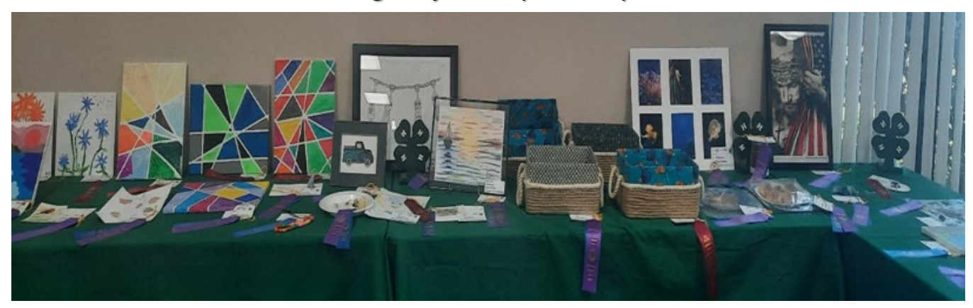
Proud of all the 4-Hers that entered exhibits into the fair. We had 42 entries in our 4-H Youth Division. We also had entries that placed in the adult division Look at all the blue and purple ribbons!