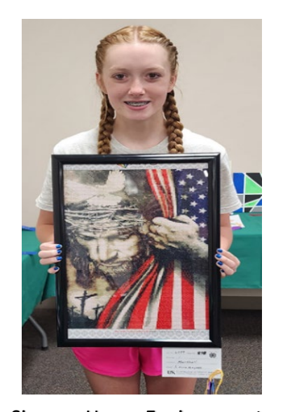
Sierra – Home Environment Accessory for the Home