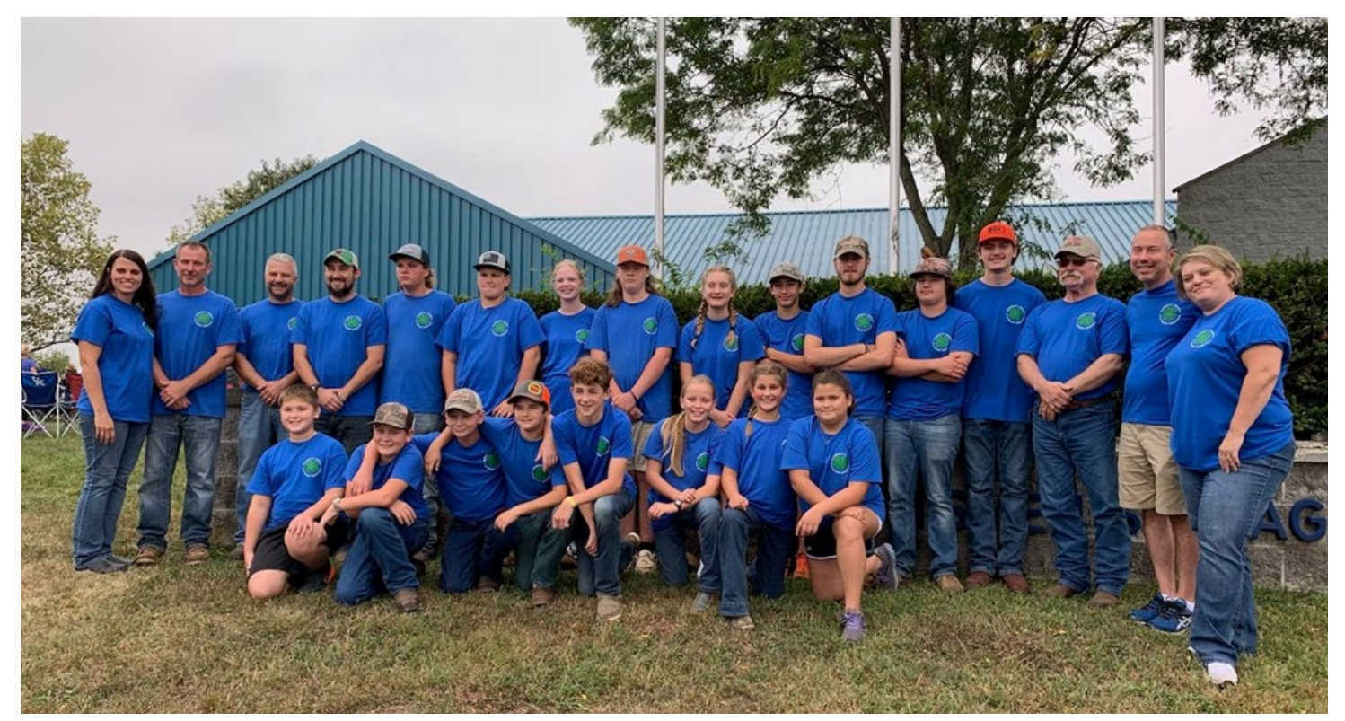
Above: Marshall County 4-H Sharp Shooters who competed in 2023 State 4-H Shoot with Coaches. Below: 4-Hers that received trophies at State Shoot.